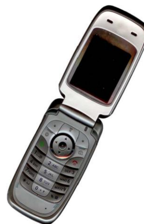
Fig. 3 Example of an image with acceptable resolution